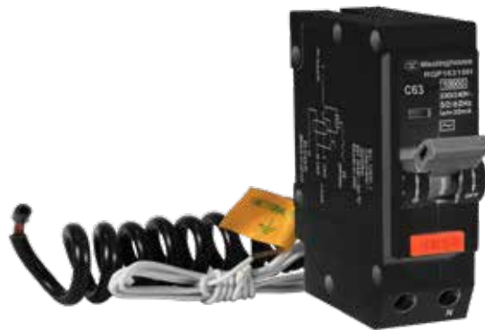
RQPB Electronic Combined RCBO/MCB Device, 10kA 1Pole 240V, 10mA Type AC Curve C