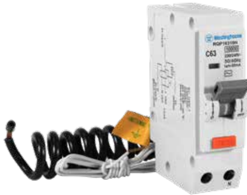
RQP Electronic Combined RCBO/MCB Device, 10kA 1Pole 240V, 10mA Type AC Curve C