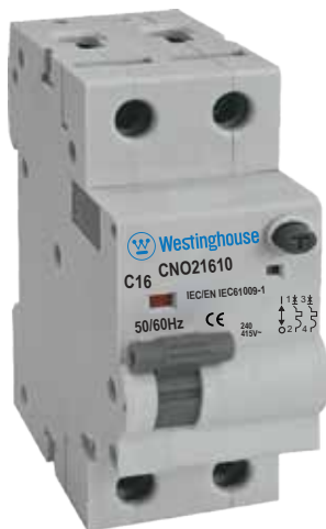
CNO 2Pole 6kA, IEC/EN61009-1 Residual Current Circuit Breakers 10mA Type AC Curve C .