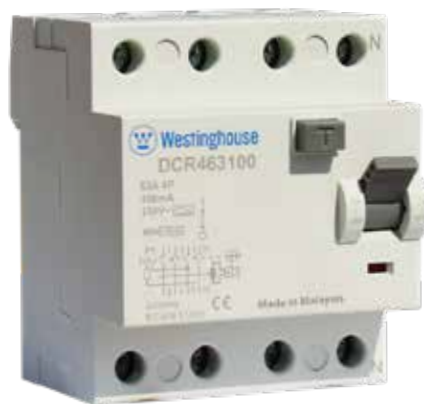
Type DCR IEC/EN61008 Residual Current Circuit Breakers 30mA Type AC.